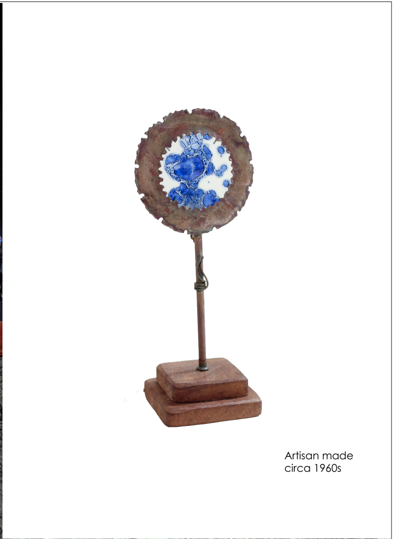
Artisan made circa 1960s