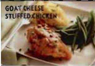
GOAT CHEESE STUFFED CHICKEN