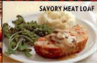
SAVORY MEAT LOAF