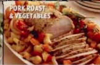
PORK ROAST & VEGETABLES